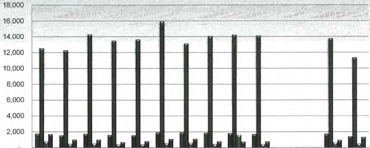
YTD 2015 SOMS Volume Metric