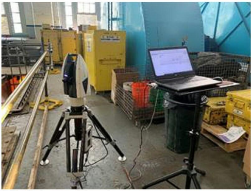
^ATS Laser Tracker