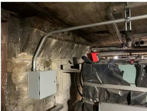
^New J-Box and Conduit in Basement