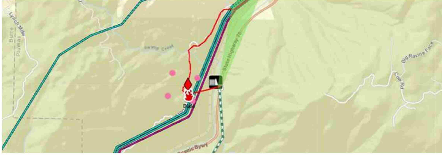
Customer SmartMeter Network Status