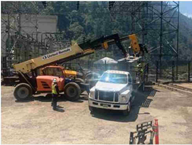
^Relocating Spreader Beam to Powerhouse