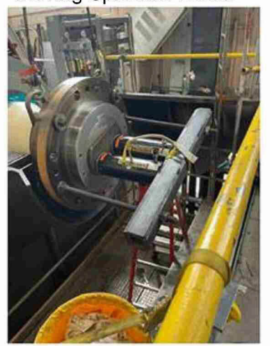
^Removable Hub Fixture