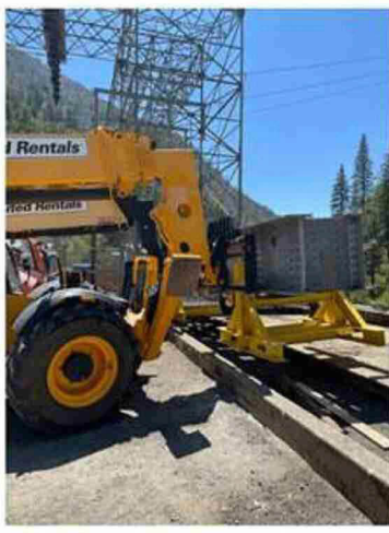
^Moving Spreader Beam