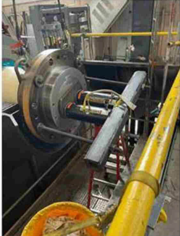
^Removable Hub Fixture