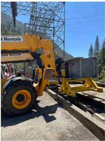
^Moving Spreader Beam