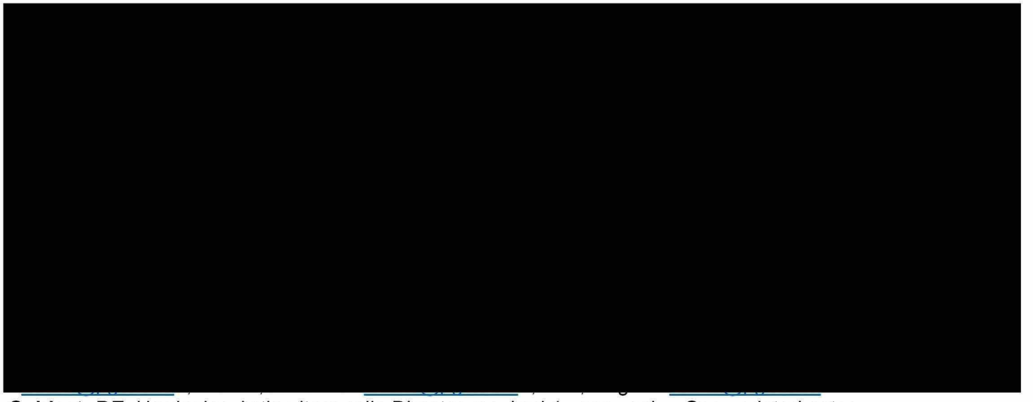
Subject: RE: Hardening Action item calls-Director required 1x per week. - See updated notes.