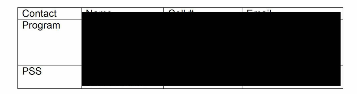
13:00 – 13:30 Daily Debrief Conference Call