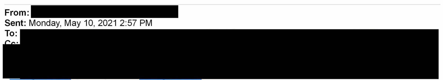
Subject: FW: CUPA and Highway 70 Undergrounding

Senior Distribution Designer Energy <u>Experts International</u> Office: Working remotely – Mobile: