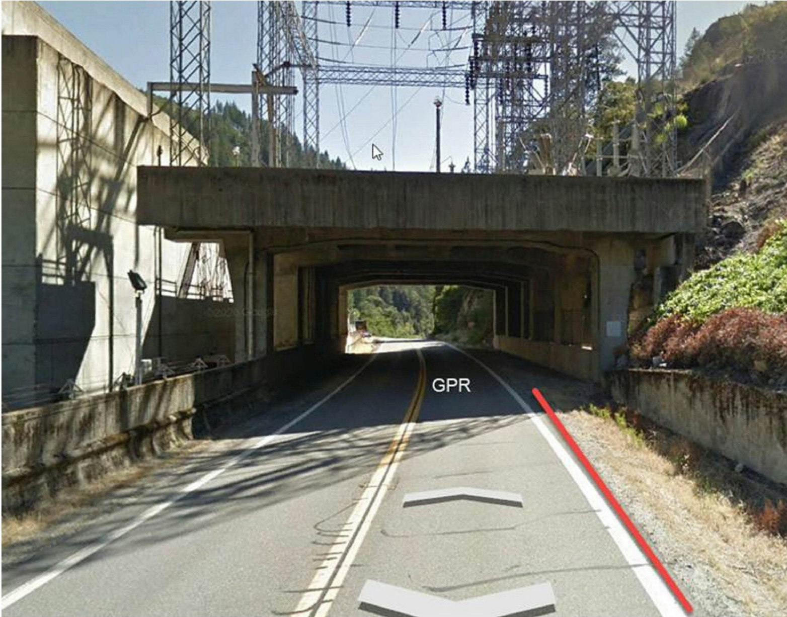
UPRR Rock Creek

Need to see if Hydro has GPR data for the Hwy 70 road bed to see if we can get 42" minimum cover and keep clearance over any hydro facilities.