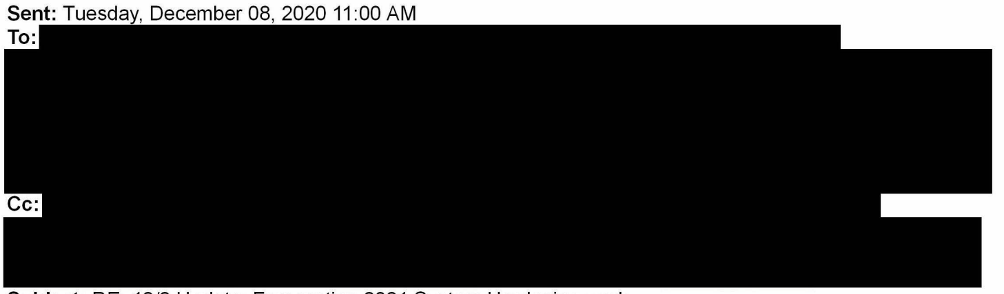
Subject: RE: 12/2 Update: Forecasting 2021 System Hardening work